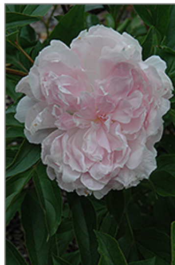
La France Peony flowers