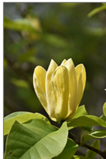
Yellow Bird Magnolia flowers