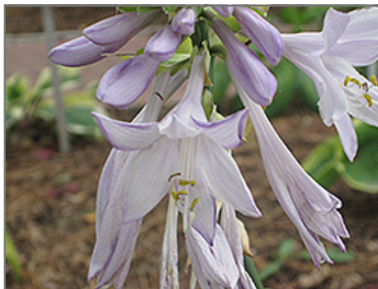
Fried Bananas Hosta flowers

Fried Bananas Hosta will grow to be about 24 inches tall at maturity extending to 3 feet tall with the flowers, with a spread of 4 feet. When grown in masses or used as a bedding plant, individual plants should be spaced approximately 4 feet apart. Its foliage tends to remain dense right to the ground, not requiring facer plants in front. It grows at a fast rate, and under ideal conditions can be expected to live for approximately 10 years. As an herbaceous perennial, this plant will usually die back to the crown each winter, and will regrow from the base each spring. Be careful not to disturb the crown in late winter when it may not be readily seen!