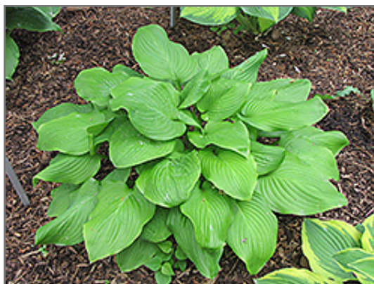
Fried Bananas Hosta