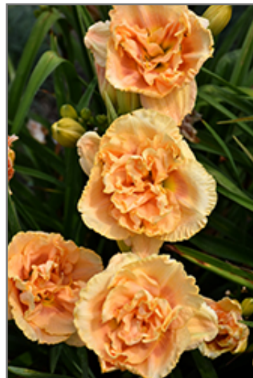
Rainbow Rhythm Siloam Peony Display Daylily flowers

Rainbow Rhythm Siloam Peony Display Daylily is recommended for the following landscape applications;