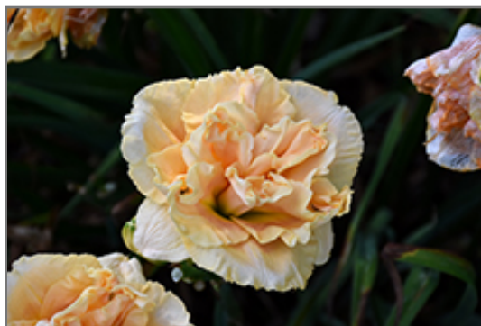
Rainbow Rhythm Siloam Peony Display Daylily flowers