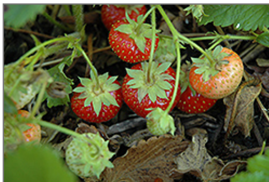
Common Wild Strawberry

Common Wild Strawberry features dainty white cup-shaped flowers with yellow eyes along the stems from late spring to early summer. Its attractive tomentose round compound leaves remain green in colour throughout the season. It features an abundance of magnificent cherry red berries from late spring to late summer.