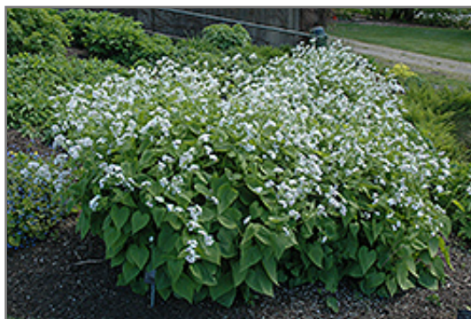
Perennial Money Plant in bloom

Perennial Money Plant is recommended for the following landscape applications;