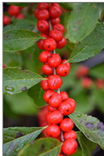
Red Sprite Winterberry fruit

Red Sprite Winterberry is recommended for the following landscape applications;