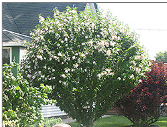
Morning Star Rose of Sharon in bloom