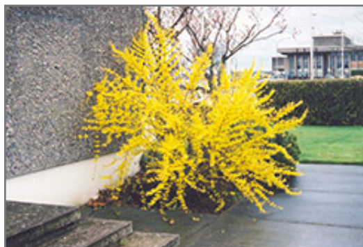
Showy Border Forsythia in bloom