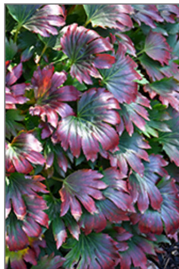
Crimson Fans Mukdenia foliage

This is a relatively low maintenance plant, and is best cleaned up in early spring before it resumes active growth for the season. It has no significant negative characteristics.