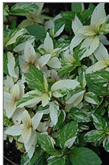
Variegated Peppermint foliage