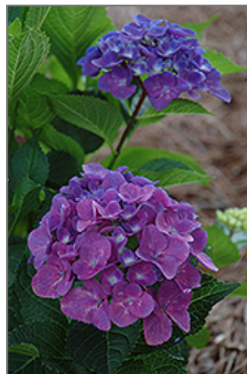
Cityline Venice Dwarf Hydrangea flowers

Cityline Venice Dwarf Hydrangea is recommended for the following landscape applications;