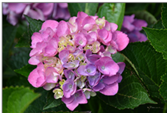
Cityline Venice Dwarf Hydrangea flowers