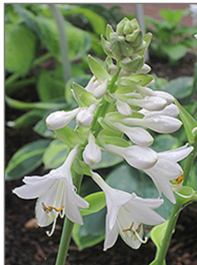
King Tut Hosta flowers