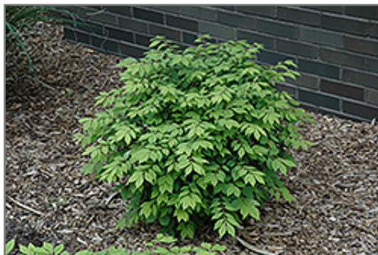
Little Moses Burning Bush