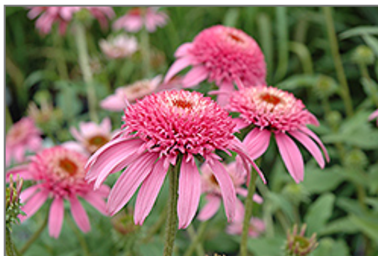
Cone-fections Pink Double Delight Coneflower flowers

Cone-fections Pink Double Delight Coneflower is recommended for the following landscape applications;