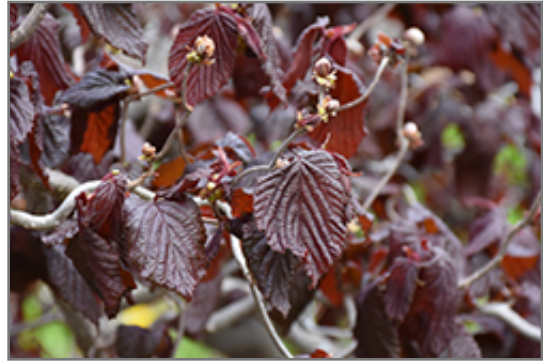
Red Majestic Corkscrew Hazelnut foliage

This shrub does best in full sun to partial shade. It is very adaptable to both dry and moist locations, and should do just fine under average home landscape conditions. It is not particular as to soil type or pH. It is highly tolerant of urban pollution and will even thrive in inner city environments. This is a selected variety of a species not originally from North America.