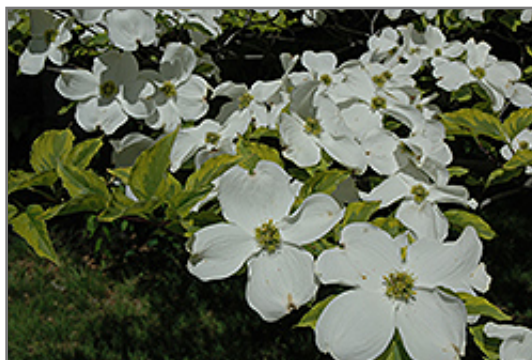
Rainbow Flowering Dogwood flowers

This is a relatively low maintenance tree, and should only be pruned after flowering to avoid removing any of the current season's flowers. It is a good choice for attracting birds to your yard. Gardeners should be aware of the following characteristic(s) that may warrant special consideration;