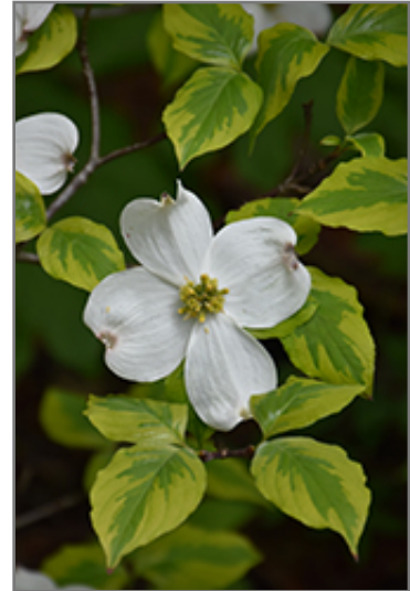
Rainbow Flowering Dogwood flowers

This tree does best in full sun to partial shade. You may want to keep it away from hot, dry locations that receive direct afternoon sun or which get reflected sunlight, such as against the south side of a white wall. It requires an evenly moist well-drained soil for optimal growth, but will die in standing water. It is very fussy about its soil conditions and must have rich, acidic soils to ensure success, and is subject to chlorosis (yellowing) of the foliage in alkaline soils. It is quite intolerant of urban pollution, therefore inner city or urban streetside plantings are best avoided, and will benefit from being planted in a relatively sheltered location. Consider applying a thick mulch around the root zone in winter to protect it in exposed locations or colder microclimates. This is a selection of a native North American species.