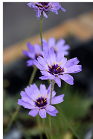
Cupid's Dart flowers

Cupid's Dart is recommended for the following landscape applications;