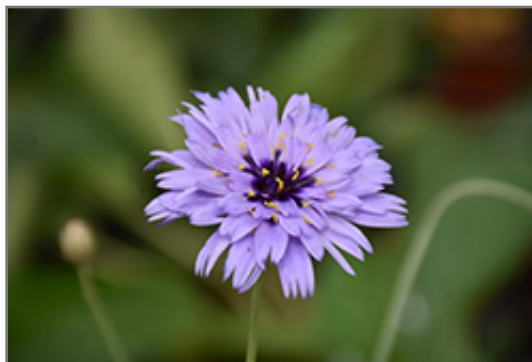
Cupid's Dart flowers