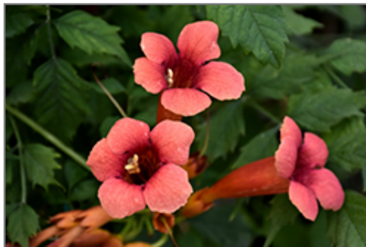
Flamenco Trumpetvine flowers