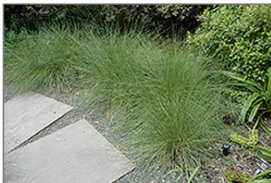
Hairawn Muhly

Hairawn Muhly is recommended for the following landscape applications;