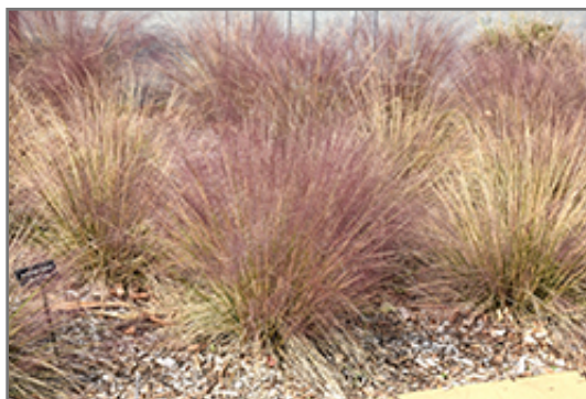
Hairawn Muhly in fall