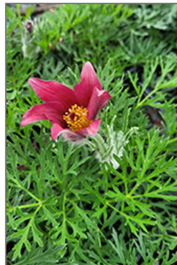
Red Pasqueflower flowers