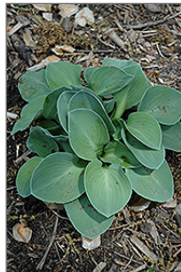
Blue Mouse Ears Hosta