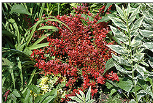
Cherry Bomb Japanese Barberry