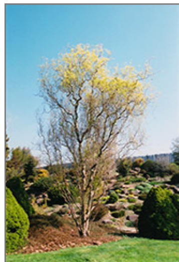
Dragon's Claw Willow in winter