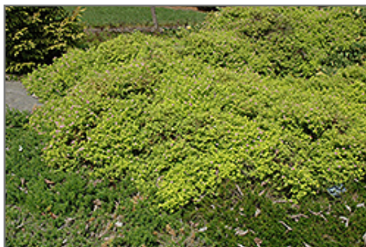
Golden Elf Spirea

Golden Elf Spirea is recommended for the following landscape applications;