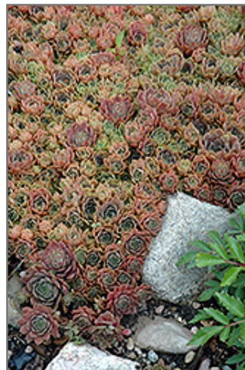
Silverine Hens And Chicks