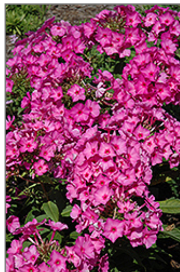
Flame Pink Garden Phlox flowers