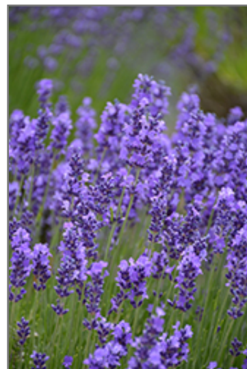
Hidcote Lavender flowers