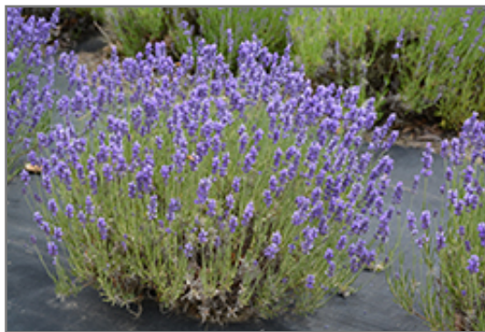
Hidcote Lavender in bloom