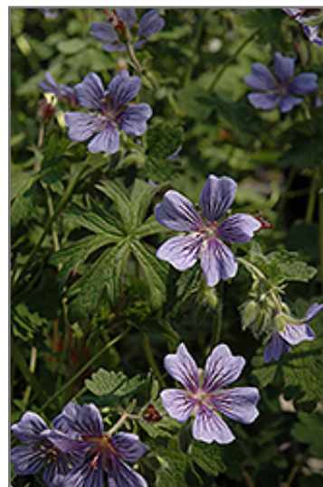
Brookside Cranesbill flowers

Brookside Cranesbill is recommended for the following landscape applications;