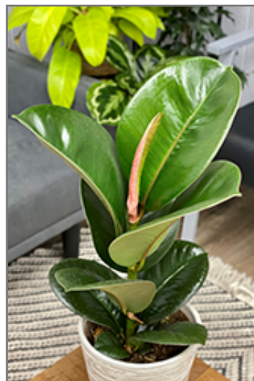
Chroma Chloe Rubber Plant in full

When grown indoors, Chroma Chloe Rubber Plant can be expected to grow to be about 8 feet tall at maturity, with a spread of 4 feet. It grows at a medium rate, and under ideal conditions can be expected to live for approximately 50 years. This houseplant will do well in a location that gets either direct or indirect sunlight, although it will usually require a more brightly-lit environment than what artificial indoor lighting alone can provide. It does best in average to evenly moist soil, but will not tolerate standing water. The surface of the soil shouldn't be allowed to dry out completely, and so you should expect to water this plant once and possibly even twice each week. Be aware that your particular watering schedule may vary depending on its location in the room, the pot size, plant size and other conditions; if in doubt, ask one of our experts in the store for advice. It will benefit from a regular feeding with a general-purpose fertilizer with every second or third watering. It is not particular as to soil pH, but grows best in rich soil. Contact the store for specific recommendations on pre-mixed potting soil for this plant. Be warned that parts of this plant are known to be toxic to humans and animals, so special care should be exercised if growing it around children and pets.