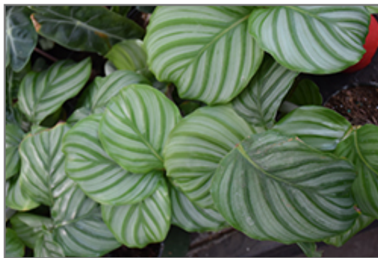
Color Full Orbifolia Prayer Plant foliage