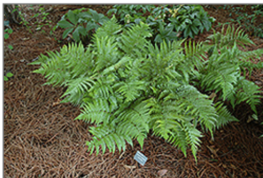
Autumn Fern

Autumn Fern will grow to be about 18 inches tall at maturity, with a spread of 18 inches. Its foliage tends to remain dense right to the ground, not requiring facer plants in front. It grows at a medium rate, and under ideal conditions can be expected to live for approximately 15 years. As an evergreen perennial, this plant will typically keep its form and foliage year-round.