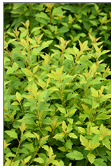
Raspberry Lemonade Ninebark foliage

Raspberry Lemonade Ninebark is recommended for the following landscape applications;