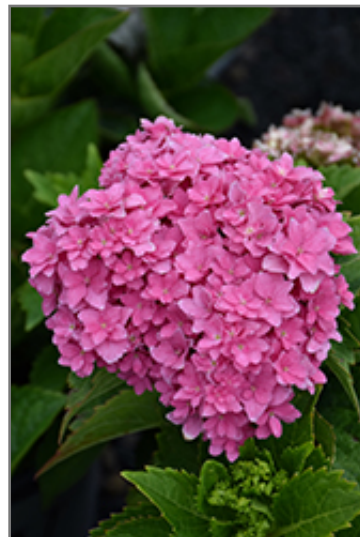
Starfield Hydrangea flowers

Starfield Hydrangea will grow to be about 3 feet tall at maturity, with a spread of 3 feet. It tends to be a little leggy, with a typical clearance of 1 foot from the ground. It grows at a fast rate, and under ideal conditions can be expected to live for approximately 20 years.