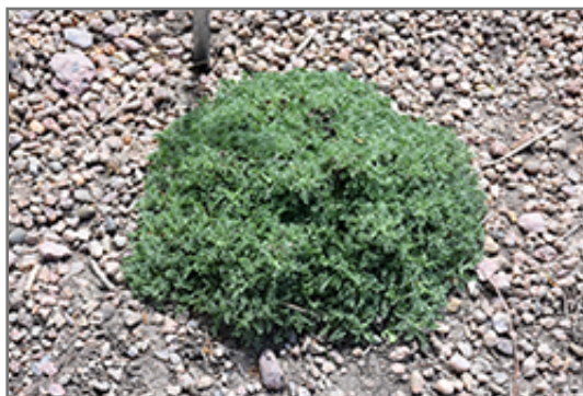
Carpeting Pincushion Flower