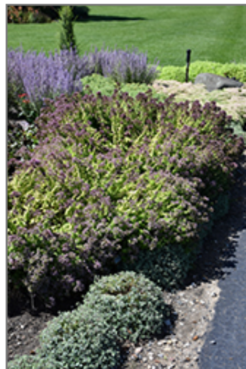
Drops of Jupiter Oregano in bloom