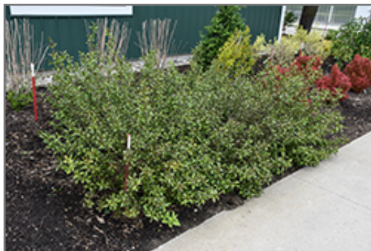
Vinho Verde Weigela