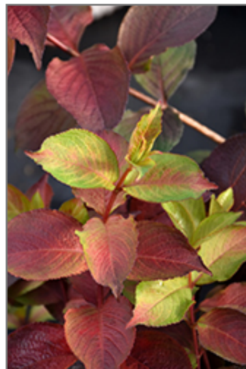
Midnight Sun Reblooming Weigela foliage