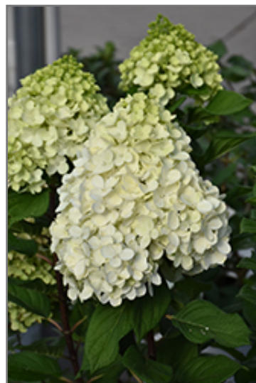
Little Lime Punch Hydrangea flowers