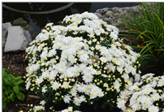
Bridal White Chrysanthemum in bloom