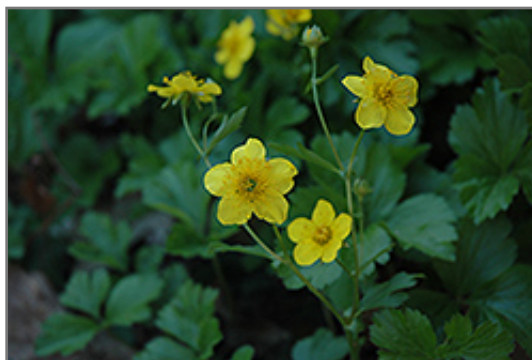
Barren Strawberry flowers