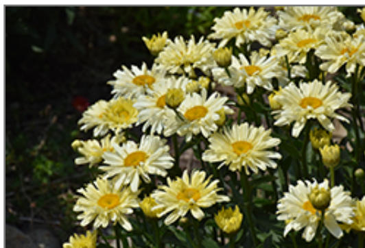
Amazing Daisies Banana Cream II Shasta Daisy flowers

Amazing Daisies Banana Cream II Shasta Daisy is an herbaceous perennial with an upright spreading habit of growth. Its medium texture blends into the garden, but can always be balanced by a couple of finer or coarser plants for an effective composition.