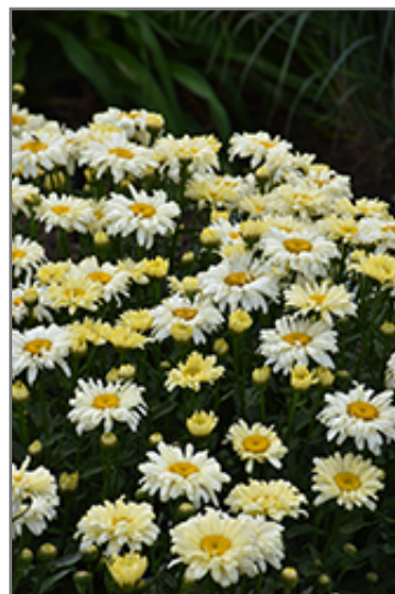
Amazing Daisies Banana Cream II Shasta Daisy flowers

Amazing Daisies Banana Cream II Shasta Daisy is a fine choice for the garden, but it is also a good selection for planting in outdoor pots and containers. With its upright habit of growth, it is best suited for use as a 'thriller' in the 'spiller-thriller-filler' container combination; plant it near the center of the pot, surrounded by smaller plants and those that spill over the edges. Note that when growing plants in outdoor containers and baskets, they may require more frequent waterings than they would in the yard or garden.