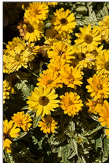
Bit Of Honey False Sunflower flowers

This is a relatively low maintenance plant, and is best cleaned up in early spring before it resumes active growth for the season. It is a good choice for attracting butterflies to your yard. It has no significant negative characteristics.