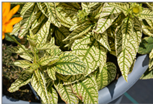
Bit Of Honey False Sunflower foliage