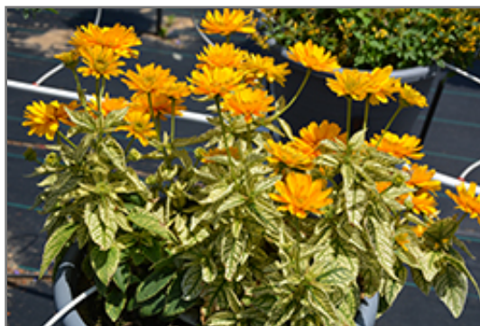
Bit Of Honey False Sunflower in bloom

Bit Of Honey False Sunflower will grow to be about 20 inches tall at maturity, with a spread of 3 feet. When grown in masses or used as a bedding plant, individual plants should be spaced approximately 30 inches apart. Its foliage tends to remain dense right to the ground, not requiring facer plants in front. It grows at a fast rate, and under ideal conditions can be expected to live for approximately 10 years. As an herbaceous perennial, this plant will usually die back to the crown each winter, and will regrow from the base each spring. Be careful not to disturb the crown in late winter when it may not be readily seen!