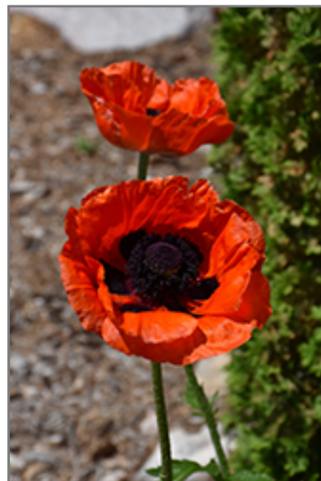
Prince Of Orange Poppy flowers