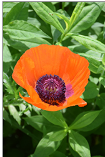
Prince Of Orange Poppy flowers

Prince Of Orange Poppy is recommended for the following landscape applications;