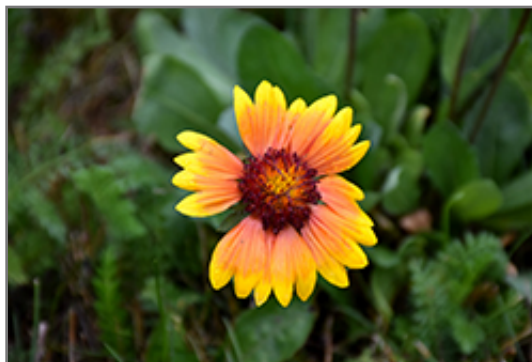
Blanket Flower flowers