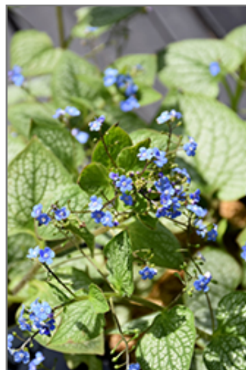
Jack of Diamonds Bugloss flowers

Jack of Diamonds Bugloss is recommended for the following landscape applications;