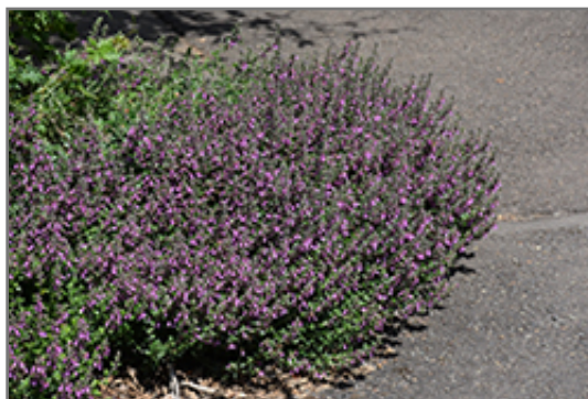
Creeping Germander in bloom

Creeping Germander will grow to be about 10 inches tall at maturity, with a spread of 18 inches. It grows at a medium rate, and under ideal conditions can be expected to live for approximately 10 years. As an evergreen perennial, this plant will typically keep its form and foliage year-round.