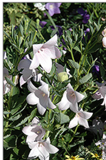
Hakone White Balloon Flower flowers

Hakone White Balloon Flower will grow to be about 18 inches tall at maturity extending to 24 inches tall with the flowers, with a spread of 18 inches. When grown in masses or used as a bedding plant, individual plants should be spaced approximately 15 inches apart. It grows at a medium rate, and under ideal conditions can be expected to live for approximately 10 years. As an herbaceous perennial, this plant will usually die back to the crown each winter, and will regrow from the base each spring. Be careful not to disturb the crown in late winter when it may not be readily seen!