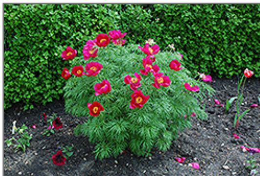
Fernleaf Peony in bloom