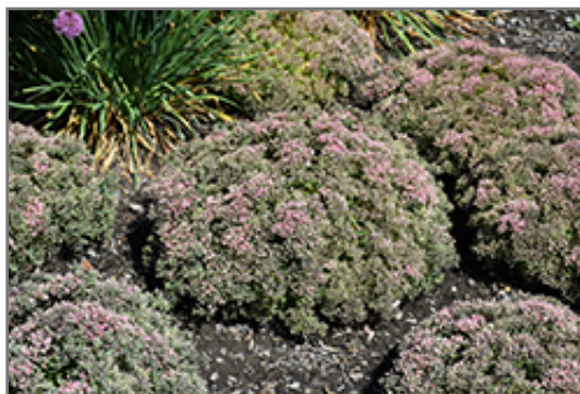
Rock 'N Round Pride and Joy Stonecrop in bloom