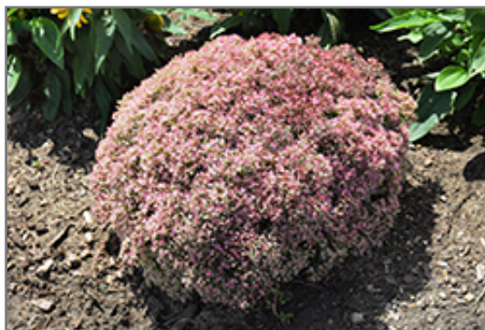
Rock 'N Round Pride and Joy Stonecrop in bloom